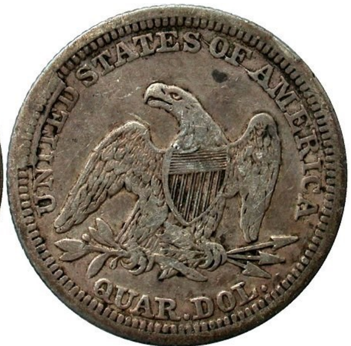
1854 Cud reverse Liberty Seated Quarter Dollar