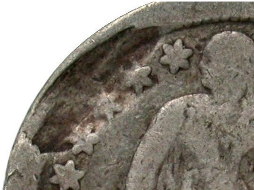
Macro View of 1843 Seated Dime "Cavern" at Stars 4 Through 6

verse metal flow allowing Stars 4 through 6 to be partially formed.