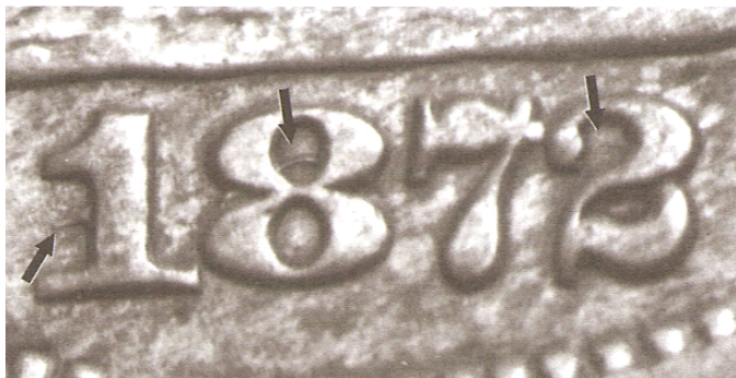
Figure 1. 1872 quarter dollar date (?)

Note: The Cherrypicker's Guide is now in its 6 th Edition and, not owning a copy, I am not sure if this error in the 4 th Edition was corrected in subsequent editions.