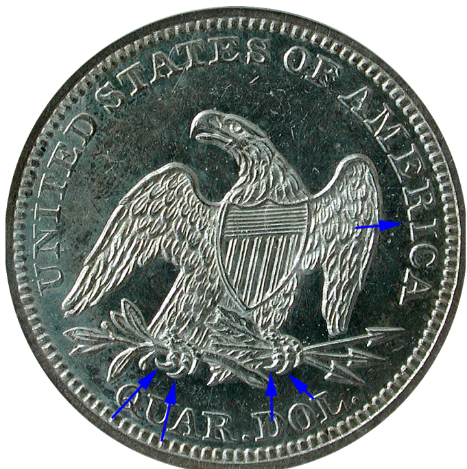
1840 Reverse A

The two reverses are illustrated in the photos below. Hopefully this will help alleviate some of the confusion.