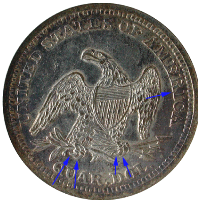
1840 Reverse B