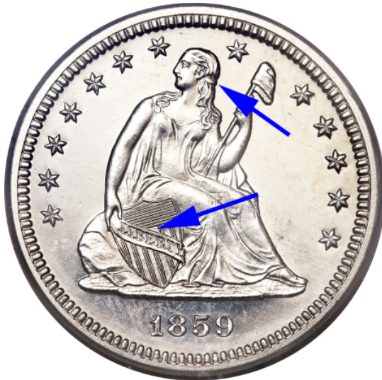
Figure 1 (Above) Type 1 Obverse

Over the next two months we will consider the relative rarity of the Philadelphia varieties of 1859 – 1861.