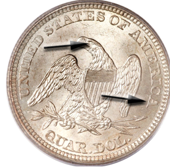
Figure 4 (Above) Type 2 Reverse