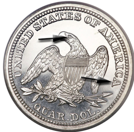
Figure 2 (Above) Type 1 Reverse