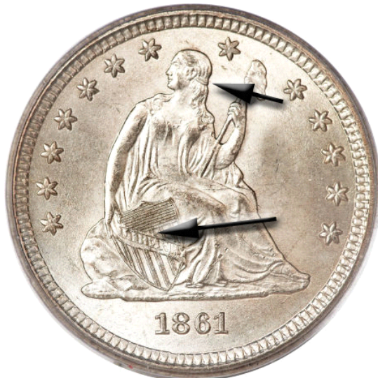
Figure 3 (Above) Type 2 Obverse